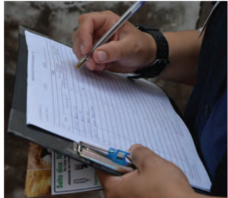
Health worker collecting records and filling out surveys with the inhabitants of Salto, Uruguay.

Understanding of public health surveillance differs considerably from country to country. Although surveillance is usually described as systematic or continuous, not all countries, institutions or scholars single out the routine nature of public health surveillance but rather emphasize the purpose and function of data collection (see Table 1). Likewise, although disease and injury always figure centrally, some definitions include determinants of important public health events (10) and environmental conditions that affect health (11). Vital registration of events like births and deaths, although often not specifically described as part of a “public health” surveillance system, is often considered to be surveillance.