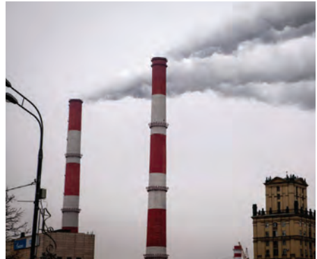
Industrial pollution. Moscow, Russia.

Global crises often expose systemic challenges that are insufficiently addressed. Undocumented migrants with tuberculosis are still not included in statistics submitted to WHO by some countries (24, 25), but it would be a mistake to assume that the only challenges are the absence of surveillance or under-reporting. Tuberculosis surveillance data, for instance, were critical for determining levels of funding from the Global Fund to Fight AIDS, Tuberculosis and Malaria. Surveillance staff sometimes