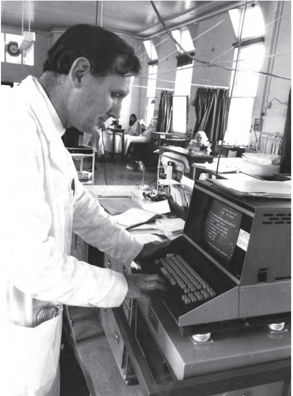
Bedside computer in the diabetic ward of the King's Hospital, London, 1970s.