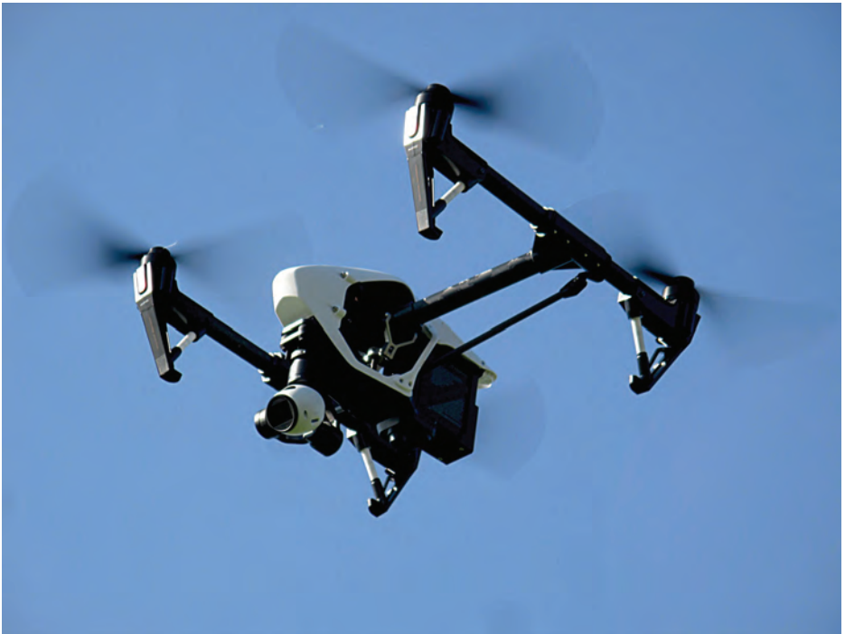
Drone in clear sky. Robert Lynch.

When the collection of names or unique identifiers is considered imperative, this requirement should be made explicit in planning the programme. Not only will countries make different judgements, but the requirement for names may not be uniform within countries. Personal data may be required only at local level, while anonymized or aggregate data may be sufficient at higher levels in a country or globally.