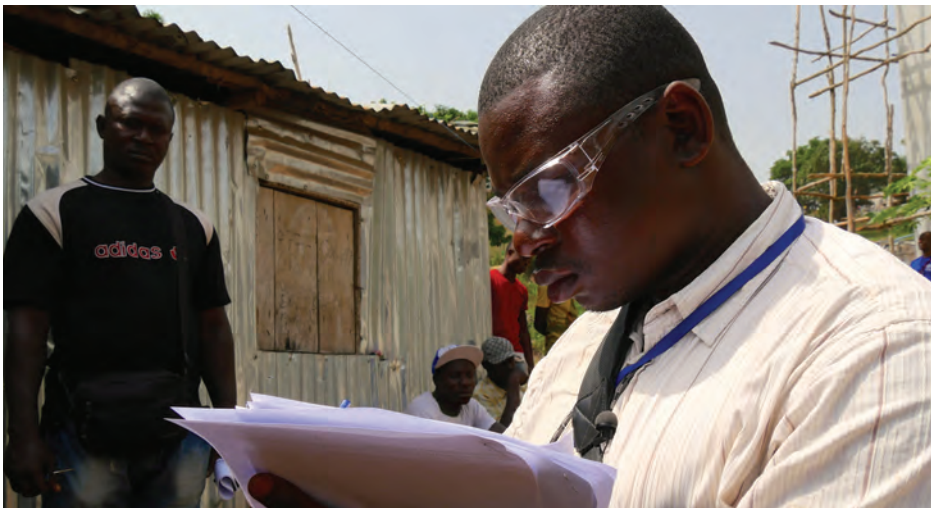
Medical student and district surveillance officer investigating suspected Ebola cases in Western Region of Sierra Leone.

As part of continuous pre-epidemic preparedness, countries should review their laws, policies and practices on data sharing to ensure that they adequately protect the confidentiality of personal information and address other relevant ethical questions, such as settling disputes about the ownership or control of surveillance data. Efforts should be made to ensure that rapid sharing of surveillance information with immediate implications for protecting public health and advancing the common good should not preclude subsequent publication in a scientific journal (87).