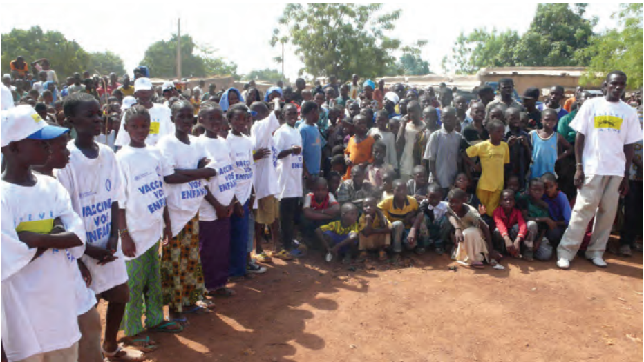
A crowd at a community event to launch a vaccination campaign.

The discipline of public health ethics has developed rapidly during the past two decades. Its central focus has been on articulating and exploring the ethical issues that arise in the pursuit of population health. This has resulted in a focus on concepts such as the common good, equity, solidarity, reciprocity, and population well-being. This is not to say that more individual values such as autonomy, privacy, and individual rights