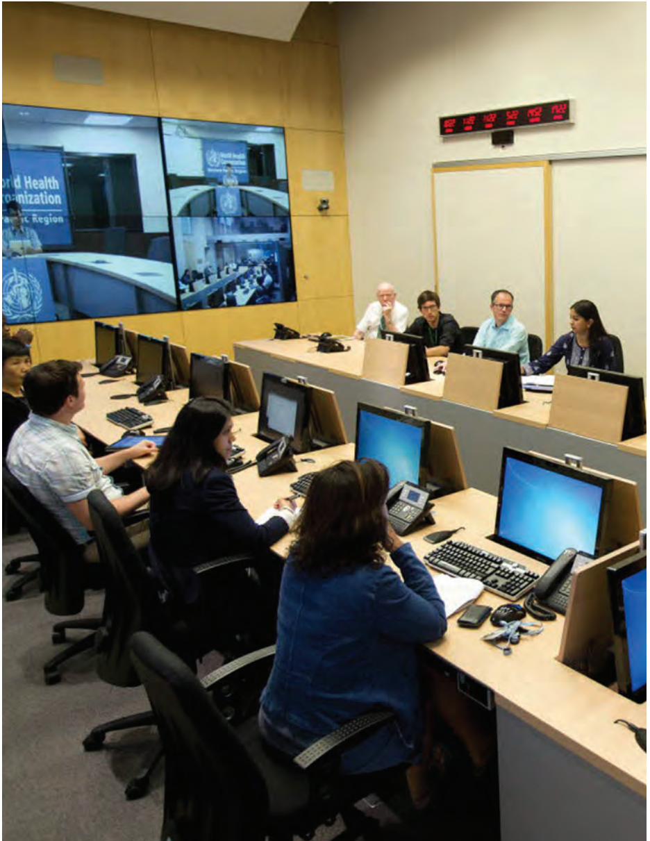
The WHO Strategic Health Operations Centre (SHOC) May 3, 2009.