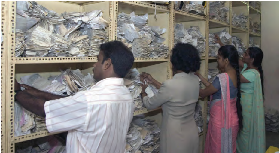
Staff at the Medical Records Office sort through patient files at Karapitayam Hospital, Galle.

The imperative to secure data should not be considered a license to refuse to use or share surveillance information effectively for legitimate public health purposes. (See guidelines 14–17 on sharing and the discussion in Guideline 2 on meaningful ethics training.)