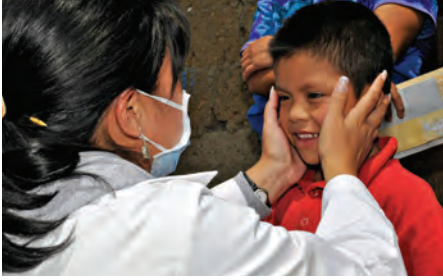
Health brigades in Chiapas, Mexico, during the epidemic of H1N1 influenza, 2009.