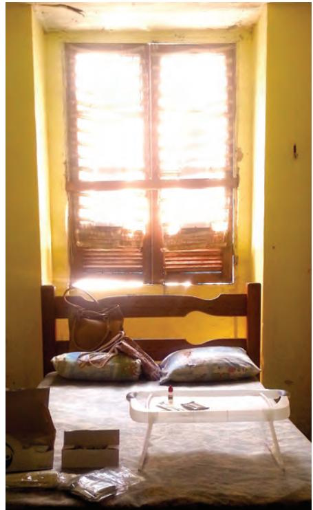
The HIV oral test on a brothel bed in Belém do Pará, Brazil.

be dismissed from work rather than receiving treatment or compensation. Wherever possible, susceptible groups should be identified before surveillance activities begin in order to minimize the risk for harm. In surveillance programmes, there should be constant monitoring for (further) harm to those in conditions of particular vulnerability. When harm does occur, a mitigation strategy should be put in place (see Guideline 8).