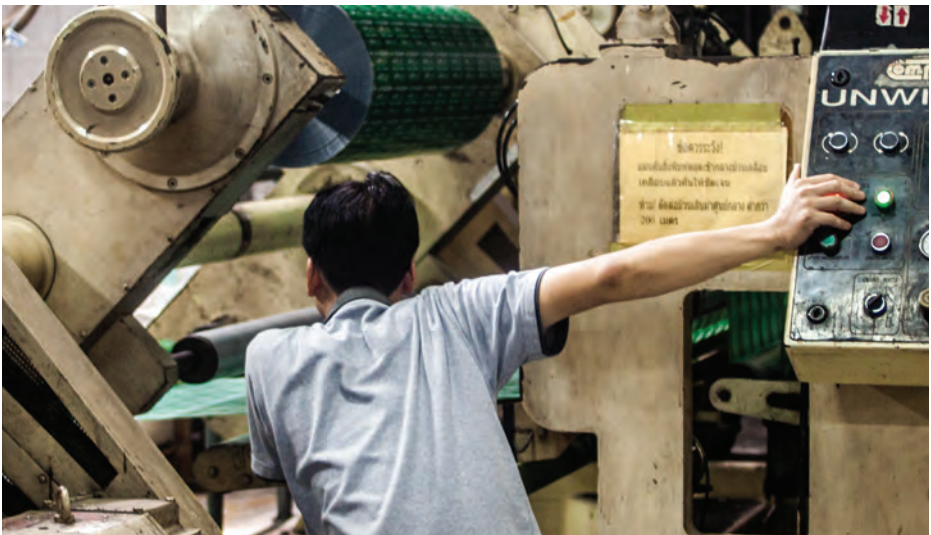
Kim Pai factory, Bangkok, June 2015.

The following guidelines, then, cover (i) the broad responsibility to undertake surveillance and subject it to ethical scrutiny; (ii) the obligation to ensure appropriate protection and rights; and (iii) considerations in making decisions about how to communicate and share surveillance data. These guidelines represent a starting point for the searching, sustained discussions that public health surveillance demands. Like other international guidelines on research ethics, the ethics of surveillance will require continuous review and revision in the light of experience.