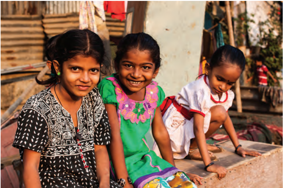
Children's Environmental Health in India.

Data collected for clinical purposes (for example to diagnose infectious disease, to monitor microbial resistance, to monitor NCDs like diabetes or to track behaviour associated with coronary heart disease or obesity) can be used for legitimate public health surveillance purposes, provided that such use meets the criteria bar set in guidelines 1, 3, 4 and 7–14 of this document. Such repurposing requires adequate protection of data security and confidentiality (Guideline 10).