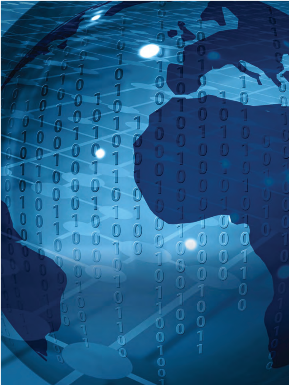
Sphere and continents with binary code zero – one.