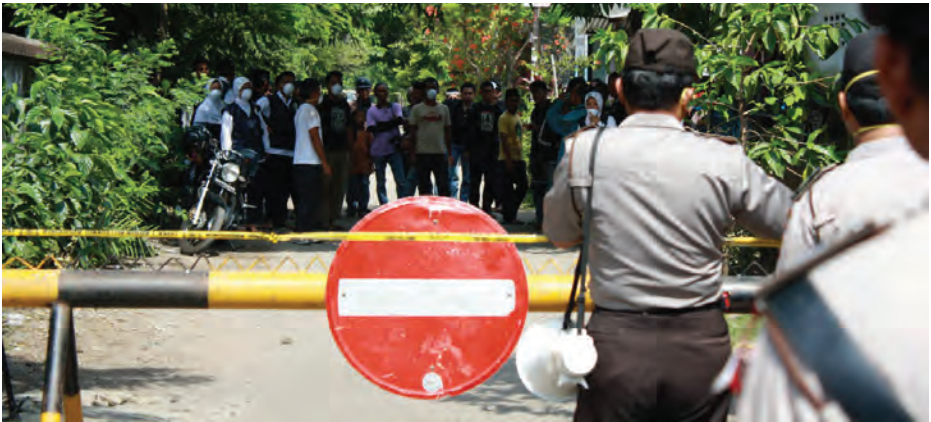
Pandemic containment exercise (simulation), conducted by the Ministry of Indonesia with the support of WHO Indonesia.

Citizens should have access to mechanisms to express their concerns and priorities with regard to surveillance. For example, communities may express concern about a potential cluster of birth defects or cancers that necessitates not only targeted epidemiological studies but also the creation of surveillance systems. Priorities should not be set solely by experts nor by those with access to health officials and policy-makers, neglecting populations with less opportunity to voice their concerns.