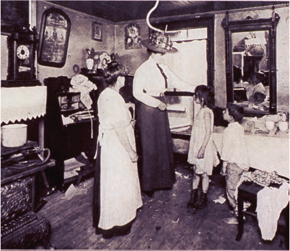
The school nurse is the most efficient link between the school and the home.

and global communities, thus potentially empowering the most vulnerable. The pursuit of equity establishes a warrant for surveillance, and the global community should provide the necessary help in moving from collecting and analysing data to action (see Guideline 6).