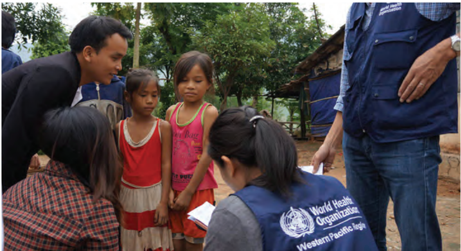
WHO Immunization officers visit Quang Binh Province, Viet Nam to monitor the Measles-Rubella Immunization campaign.

The governance mechanisms recommended in Guideline 2 should ensure that the exceptional conditions, if any, under which identifiable surveillance data may be shared are specified and made transparent. Such a review will require determination of whether the threat is of sufficient magnitude to warrant potential damage to the integrity of and trust in public health surveillance systems. Sanctions must be in place to prevent inappropriate data-sharing by public health agencies and inappropriate use of data by agencies outside the public health sector.