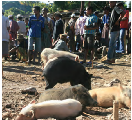
Dog and pig vendor at market day, Atsabe, Ermera.

Surveillance is conducted in a context in which there have been significant advances in the capacity to collect and share data from previously unimagined sources, such as social media or geospatial mobile phone data. There have been parallel technological leaps in possibilities for identifying disease; genetic analysis, as just one example, allows rapid identification of pathogens or pathogenic strains. At the same time, inequalities within societies and within the global community have become more marked. There are growing gulfs in the capacity of different nations and locales to take advantage of technological change. Civil conflicts in different countries inevitably trigger health crises