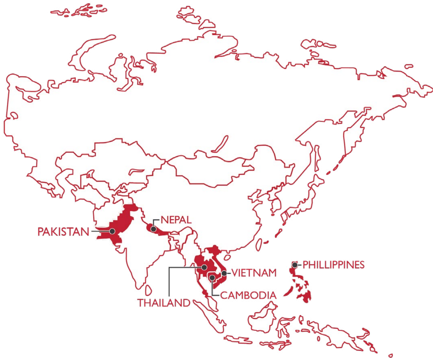
Countries for which WTFI data are currently available.