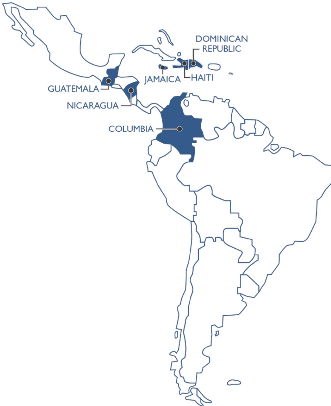
Countries for which WTFI data are currently available.