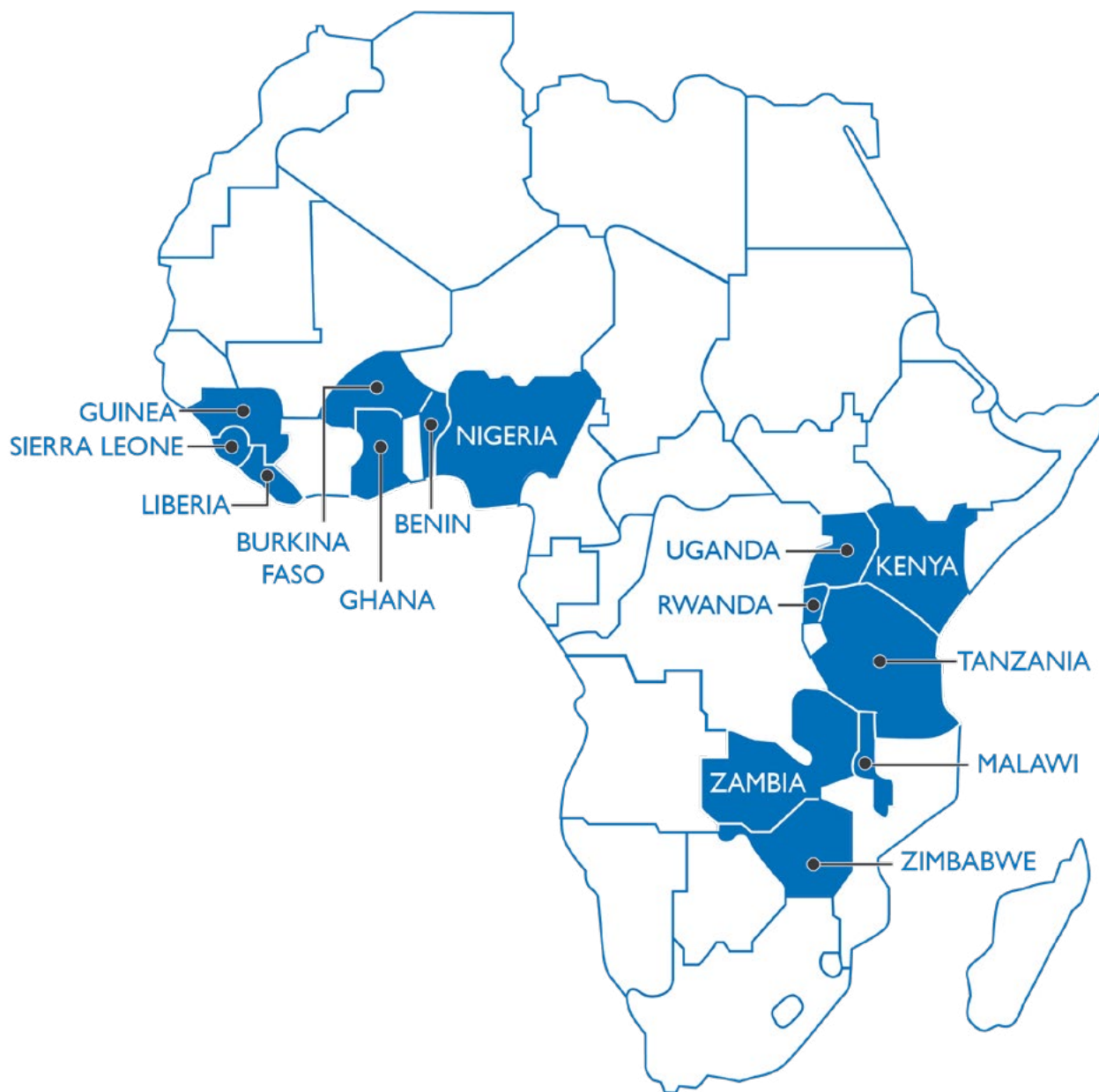
Countries for which WTFI data are currently available.